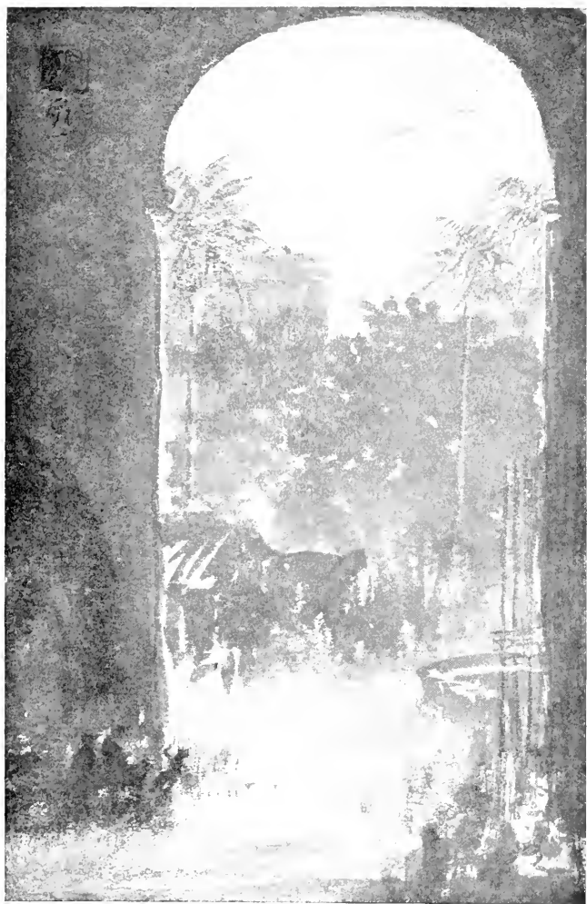
THE INNER GARDEN WAS MY PARADISE